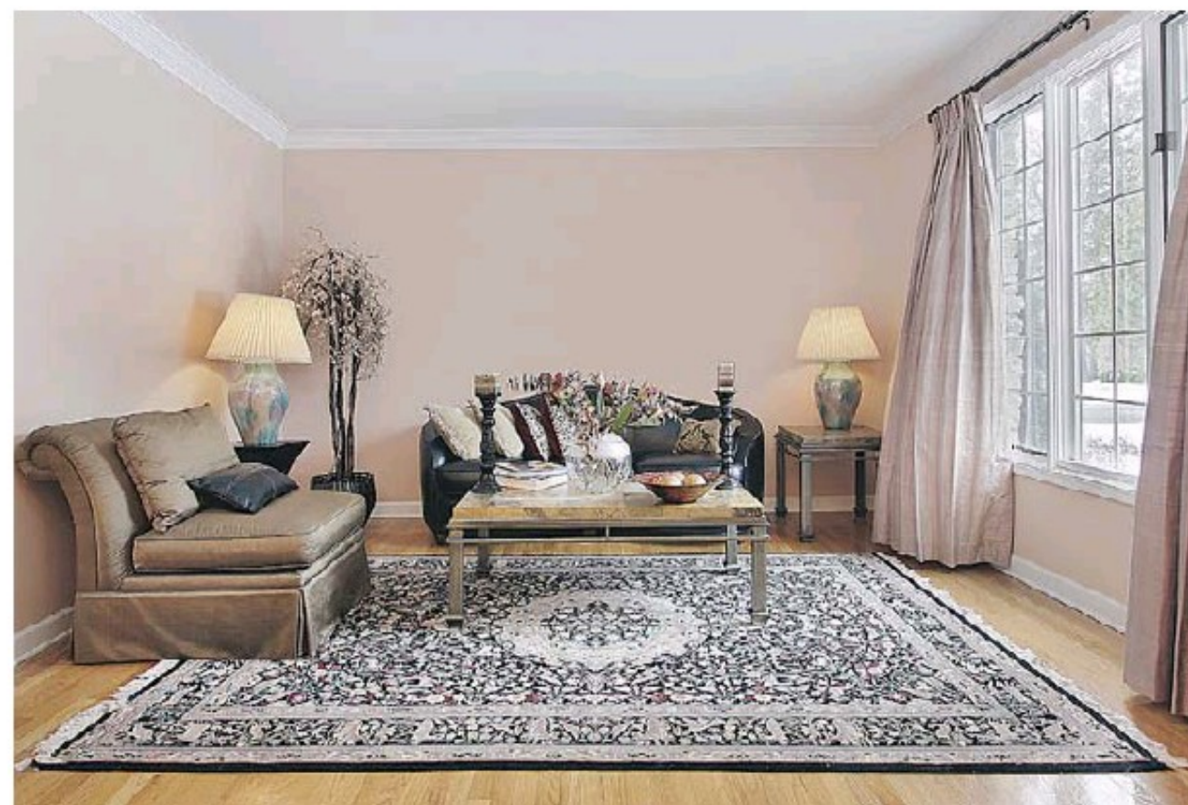
Investing in a quality carpet and underpad ensures your floor is protected, the carpet stays in place, and it lasts a long time.

In a living room, you need at least seven inches of carpet under the sofa; in