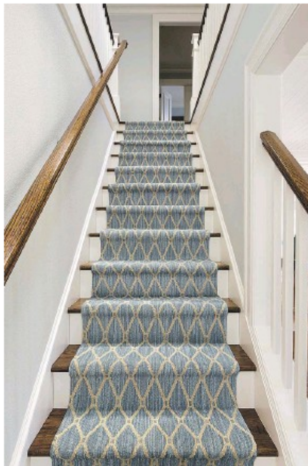
A carpet runner on the stairs not only protects the wood from wear and tear, it serves to muffle the sound of people travelling up and down.