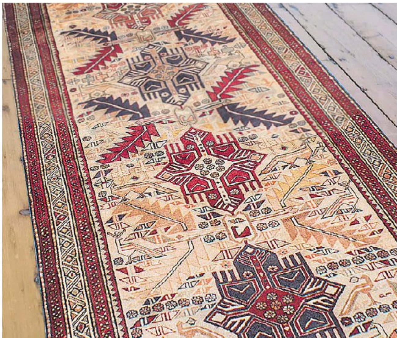
A vintage Persian rug runner adds colour and life to any room, and can be used to define a hallway type of space even where there is no hallway.

One of the size guidelines he likes to share with clients is choosing a rug